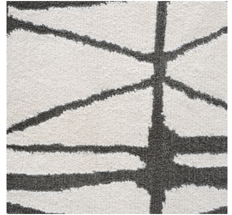
Close up of texture