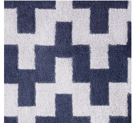
Close up of texture