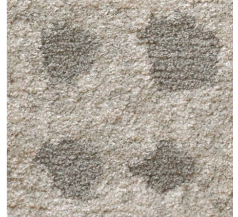
Close up of texture