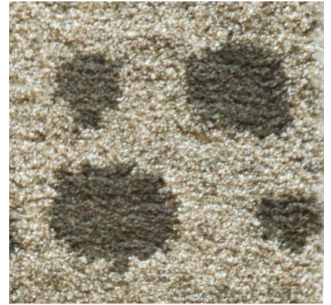
Close up of texture